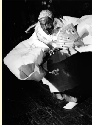
Longevity Dance, Motsuji Temple, Hiraizumi, Iwate Hideo Haga 1979