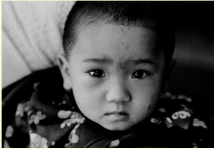
Ohamaza-cho, La Ville de la chance Hiroshi Oshima 1979