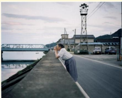
Kesengawa, 2003/08/23 Naoya Hatakeyama 2003