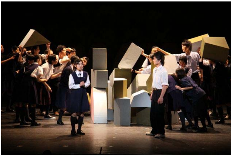
One scene in “A Message from Fukushima”

At a grand opening ceremony of the 35 th All Japan High School Cultural Festival (Fukushima Sobun) held at the Aizu Fugado hall in Aizu-Wakamatsu City, Fukushima Prefecture, on August 4, 2011, high school students in Fukushima performed a “component drama” titled “A Message from Fukushima” as a curtain raiser presented by the host prefecture. The drama drew loud applause as it depicted “Fukushima now” by capturing changes of heart and images of growth among high school students who experienced an unprecedented disaster. Another reason for the enthusiastic response was the display of their youthful energy and the spirit of Fukushima and their resolve for reconstruction to overcome difficulties and open the way for the future to domestic and international audience. A line in the drama was quoted by Prime Minister Yoshihiko